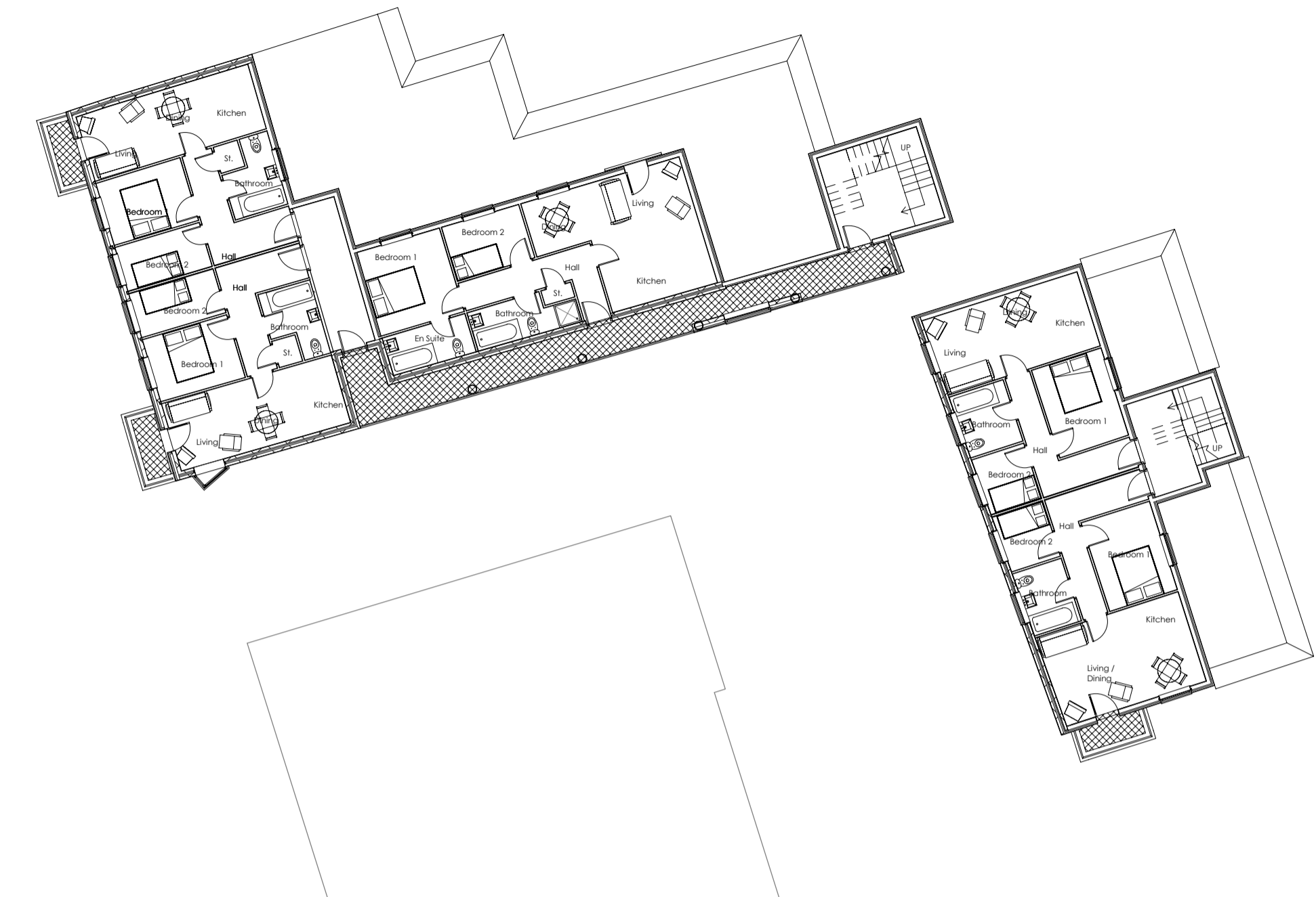
3 04 Second Floor 1 : 200