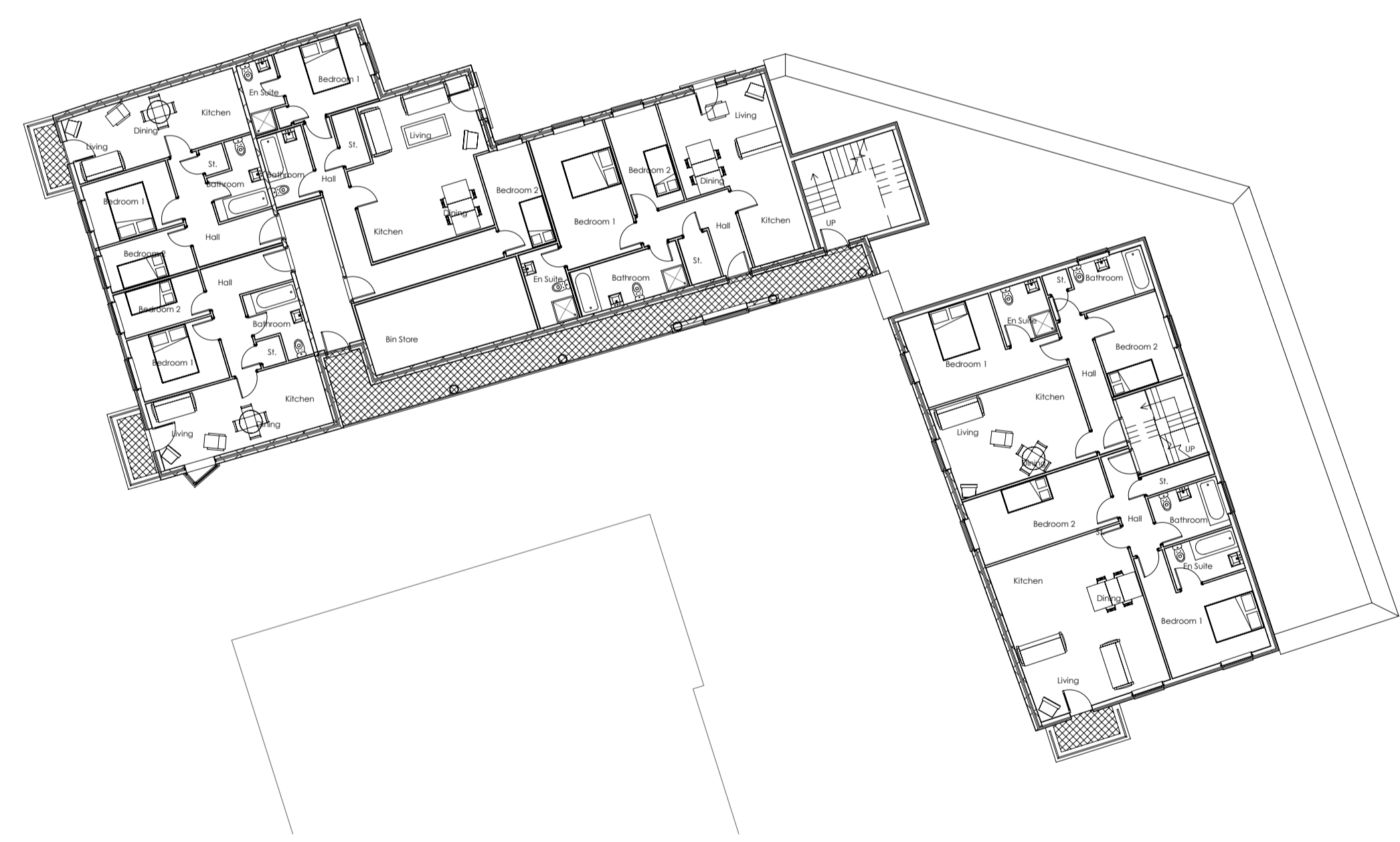
2 03 First Floor 1 : 200