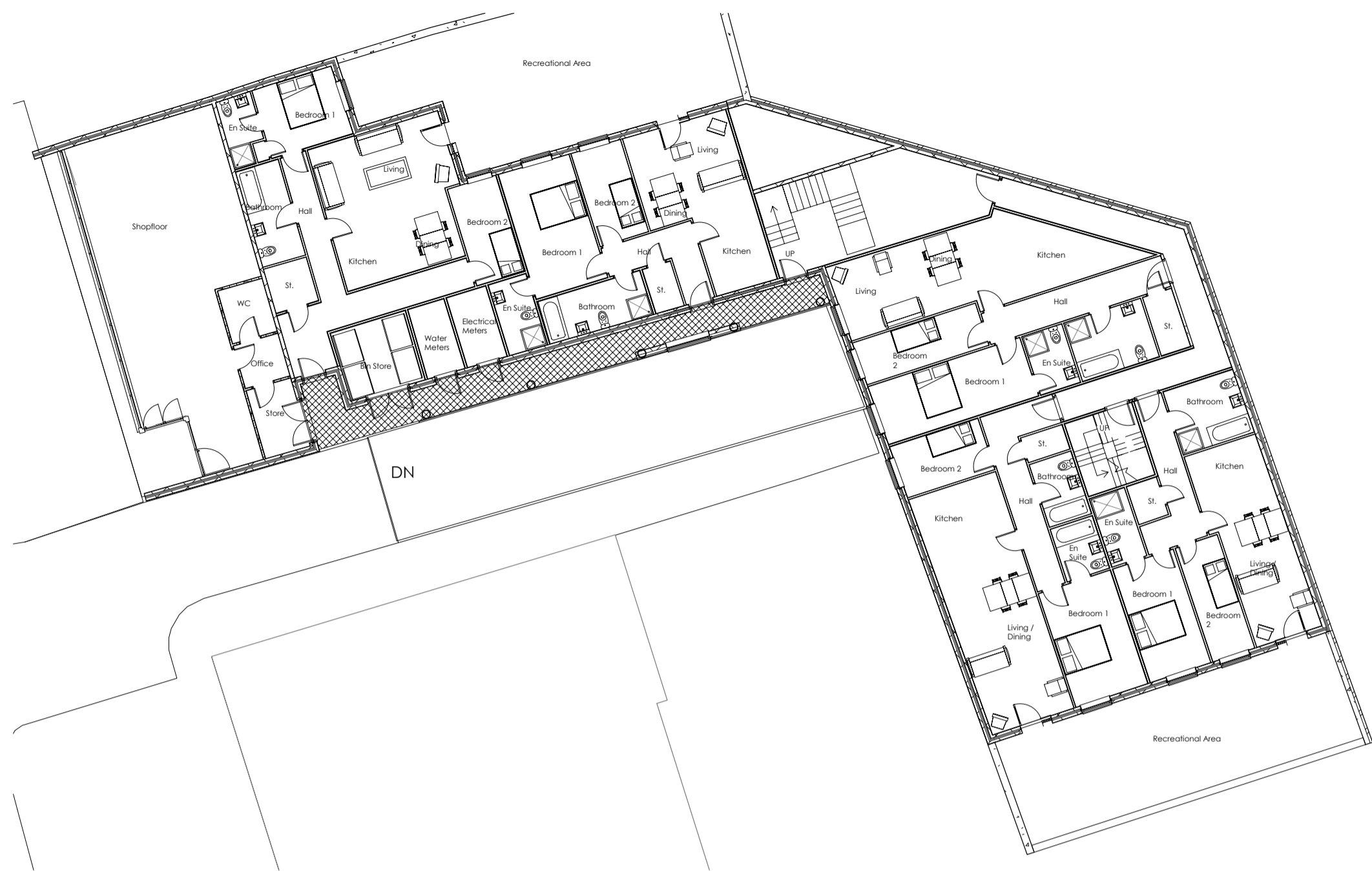
1 02 Ground Floor 1 : 200